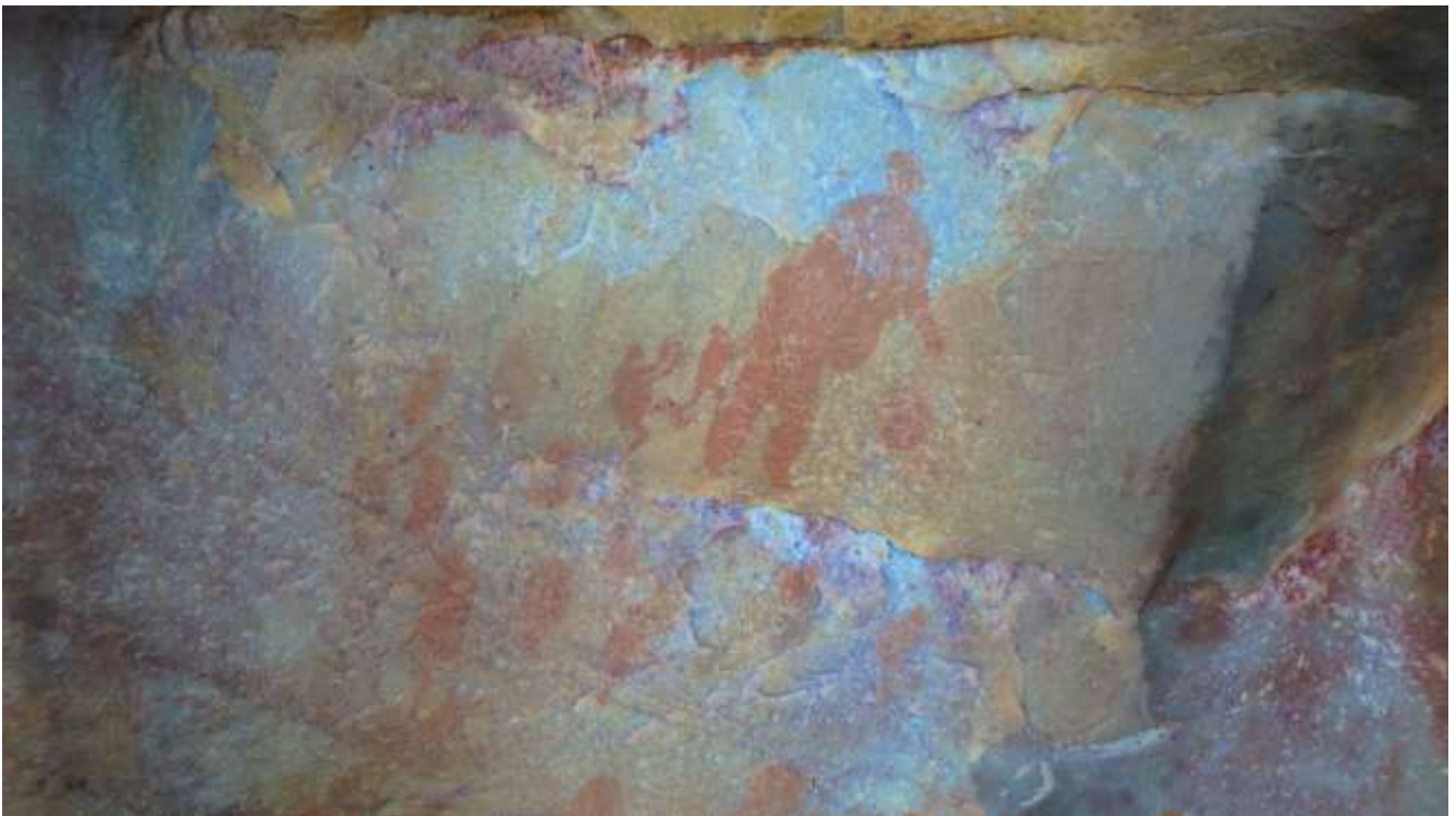
This is an unusual painting of a seemingly obese, possibly pregnant woman. The oblong dots could be termite mounds that are abundant on the northern slope of the valley.

and in kloofs below. Obelisk Rock looks like a tusk when viewed from the north and south. There is a good stream that runs a few metres from the obelisk. This flows even in dry times. It's unlikely that bushman stayed at Obelisk Rock for very long periods. Perhaps it was on a migration path or a hunting destination in dry summers. The valley stays reasonably green even in dry times, so there would have been animals to hunt.