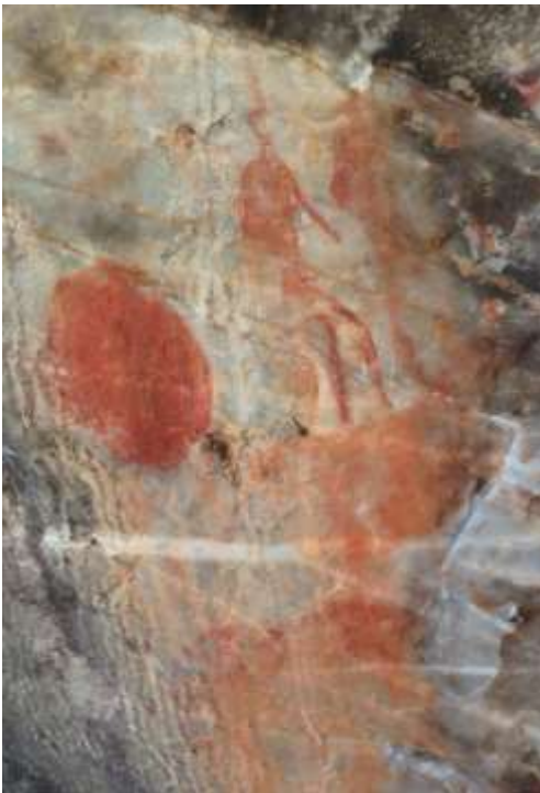
The left hand orange circle may represent a honey comb. There is a bee hive close to the painting. Orange circles are widely distributed in many painted sites all over Southern Africa.

There are no known indications that bushmen wondered higher than the valley where Obelisk Rock is located.