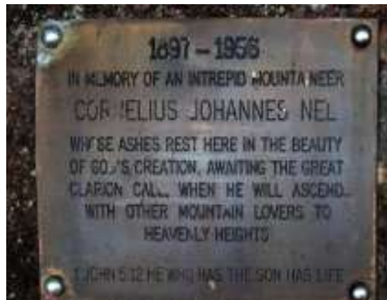
Plaque in Black Spot Cave commemorating C. J. Nel's service to mountaineering and Toverkop