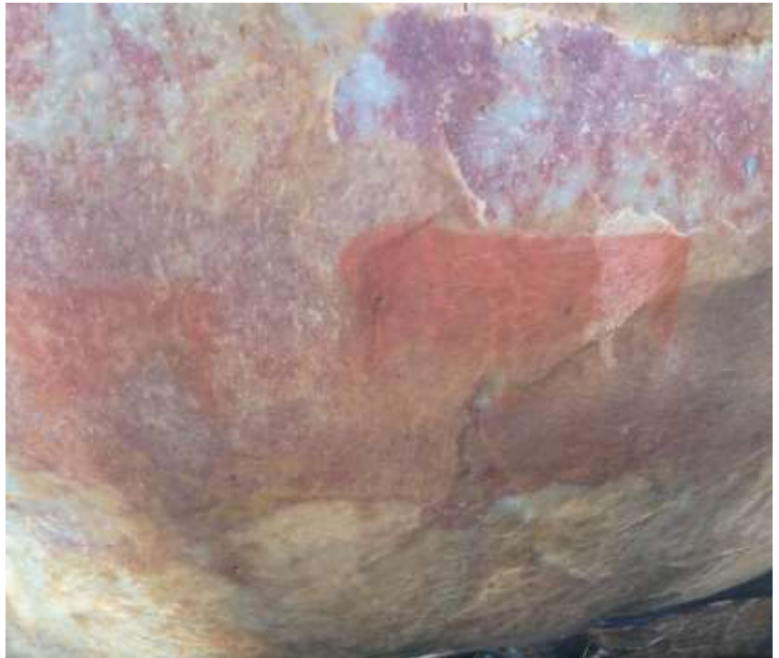
The small ears, no horns and horsey heads suggest that these may be two, now extinct, quaggas.