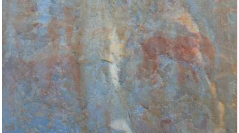
Elephants painted on the eastern side. Elephant paintings are not uncommon, but much less common than eland and other antelope.

On the eastern side of the monolith the Bushmen painted two large elephants. Bushmen were often attracted to and painted on spectacular rock formations. It is unlikely that they saw elephants so high on Toverkop, but they probably saw them on the plains