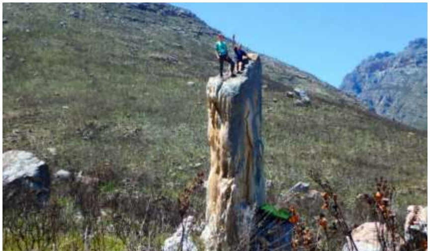
Obelisk Rock, a modern ascent via a Font 5 boulder problem on the Eastern side. Carrying the pad in was harder than Font 8A!