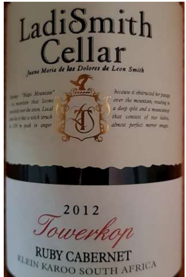
Towerkop Cellar became Ladismith Cellar, but still used Towerkop as a name for many of their wines. Note the story of the witch on this label. Ladismith Cellar was bought out Southern Wines and they unfortunately dropped Towerkop as a name.