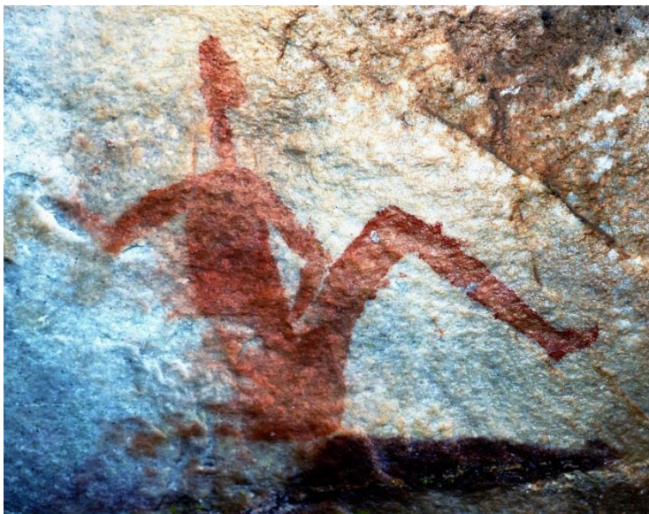
The Bushman painting in Echo Cave . Possibly a man playing a musical instrument.

Echo Cave was “discovered” by Les Armer and Charles Haynes in the mid ‘50s 11 . There are a number of faded Bushman paintings in Echo Cave , but one is still quite easily visible. The original name for Echo Cave was Dance Floor Cave , this may indicate that there were still signs of wear left by Bushmen during their dance ceremonies when the cave was “discovered” by Europeans, but may also indicate the huge size of the cave. Directly under Echo Cave is a deep low cave that extends for about 10m. This low cave is in a band of red ochre and may have been where Bushmen collected (mined) ochre. Red ochre was primarily used as body paint, possibly for rituals, decoration or simply to prevent sun burn. Red Ochre was also used in painting.