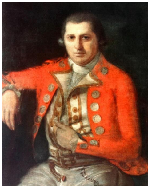
Colonel Robert Jacob Gordon 1743 - 1795

Note from scribe: A conclusively record of an ascent of Cockscomb could not be found in any of Colonel Gordon's journals or letters that are available online.