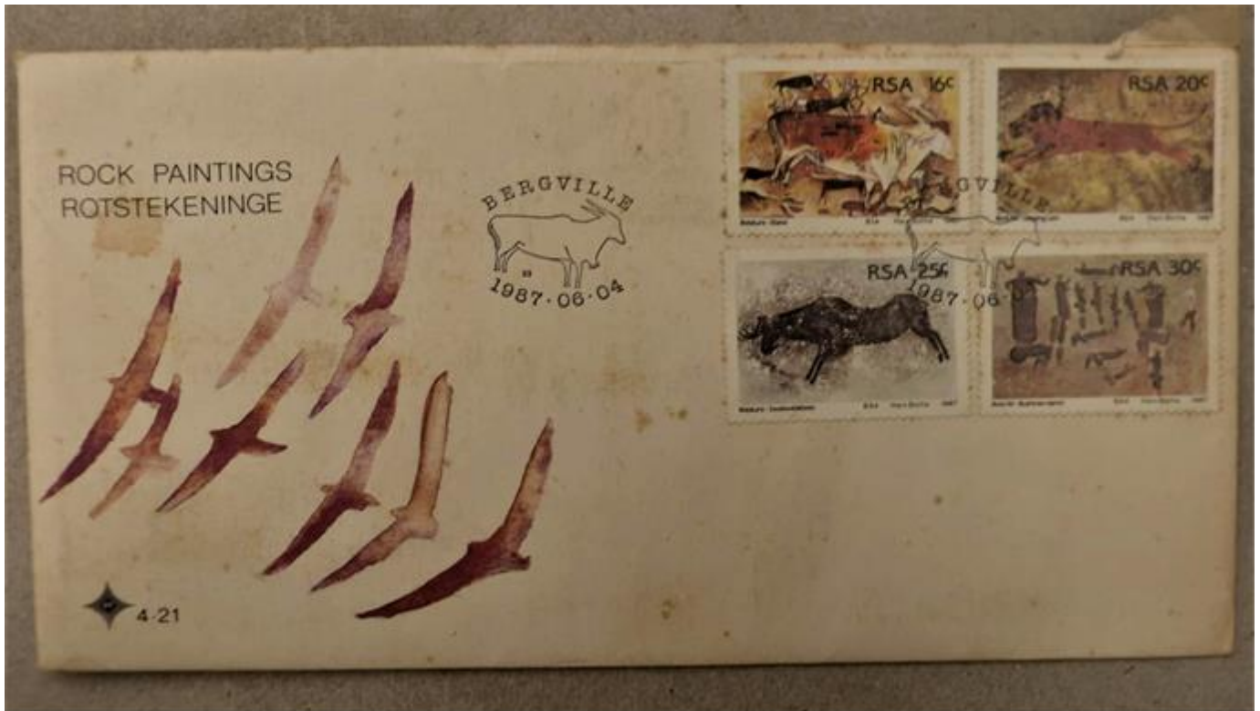
The 1987 first day cover with the vultures from Elephant Cave .

Another popular cave about 3.5km to the southeast of Cockscomb peak is Elephant Cave . Elephant Cave has a compact, symmetrical shape and is about 10m deep, but only 8m wide and 3m high at the highest point. It is a densely painted cave with over 300 images, including 81 human figures, 112 animals, at least 94 handprints and 14 finger dots. The most prominent of the animal paintings is a single large elephant and nineteen large stylistic birds that are likely to be vultures. These are prominently placed on the smoothest and cleanest painting surface on the ceiling above the viewer in the centre of the shelter. The elephant, which has a white tusk visible, is somewhat stretched or elongated. This is an indication that it may represent a mystical animal. Elephants have very sensitive smell and are able to smell rain fall at huge distances. This makes them one of the first animals to migrate towards areas that have received fresh rain. Elephant must (breeding) is connected to peak rainfall periods. Elephants in Bushman painting are often associated with rain, rainmaking and possibly procreation. The complex