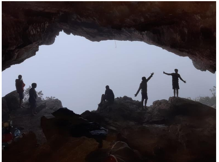
Voortrekkers in Shepherds Cave